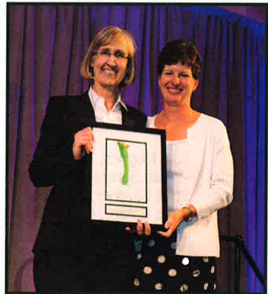
2013 Community Spirit Award Outstanding Community Partner