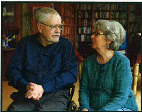
2013 Community Spirit Award Outstanding Philanthropists

More than 250 guests celebrated the contributions of these dedicated community partners at our annual gala. The evening generated over $92,000 to support Community Action's efforts to help families transition out of poverty.