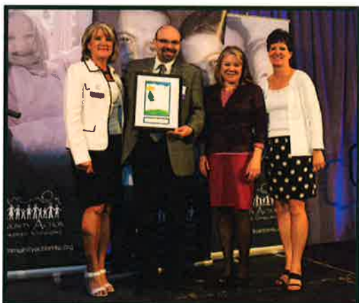
2013 Community Spirit Award Outstanding Organization