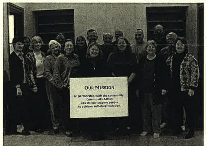
Board Retreat, February 28, 2003

Fax follow-up. Check your fax machine’s “send log” regularly to make sure faxes have been received, or ask recipients to confirm receipt by e-mail or fax. You’ll likely save grief as well as time.