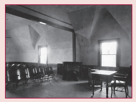
A Marsh Hall classroom before the fire