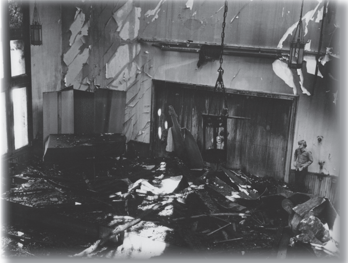
www.pacificu.edu ▼ PACIFIC UNIVERSITY 11