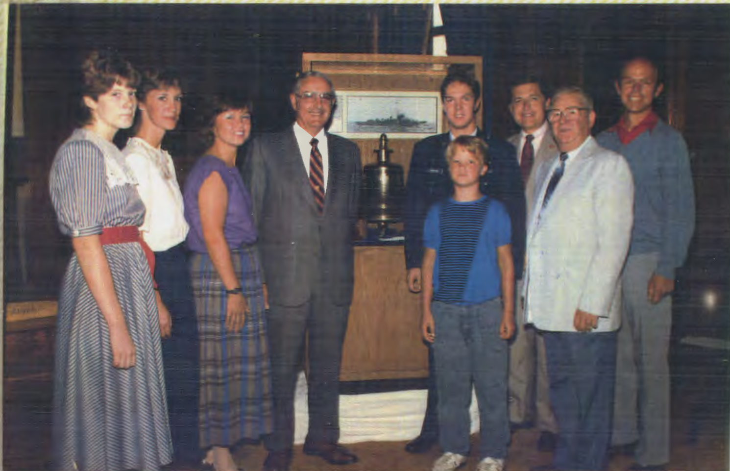
GOVENORS OFFICE CERAMONY