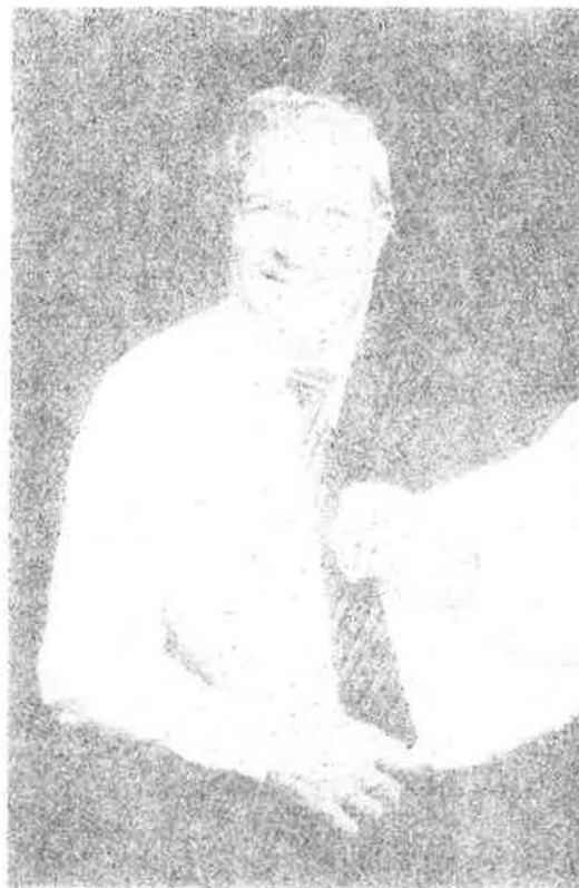
CONGRESSMAN BOB SMITH

First elected to the Congress in November 1982, Bob Smith arrived in Washington after serving 22 years in the Oregon State Legislature, including periods as Speaker of the State House of Representatives and State Senate Republican Leader. Combined with a strong private business background, primarily in the operation of his own cattle ranch, Bob Smith has been a force for positive change where ever he has gone.