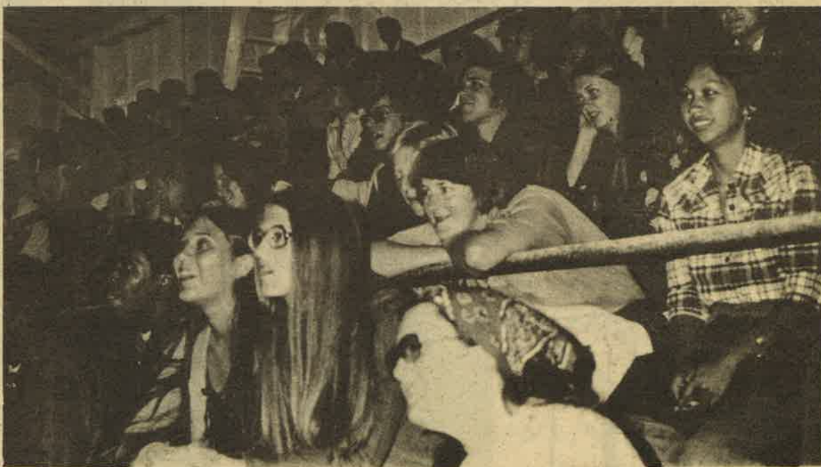
STUDENTS, FACULTY, AND ADMINISTRATORS JOIN TOGETHER in viewing Boxer football last Saturday. An important question before the campus community is whether or not the opportunity to view football at Pacific will continue.