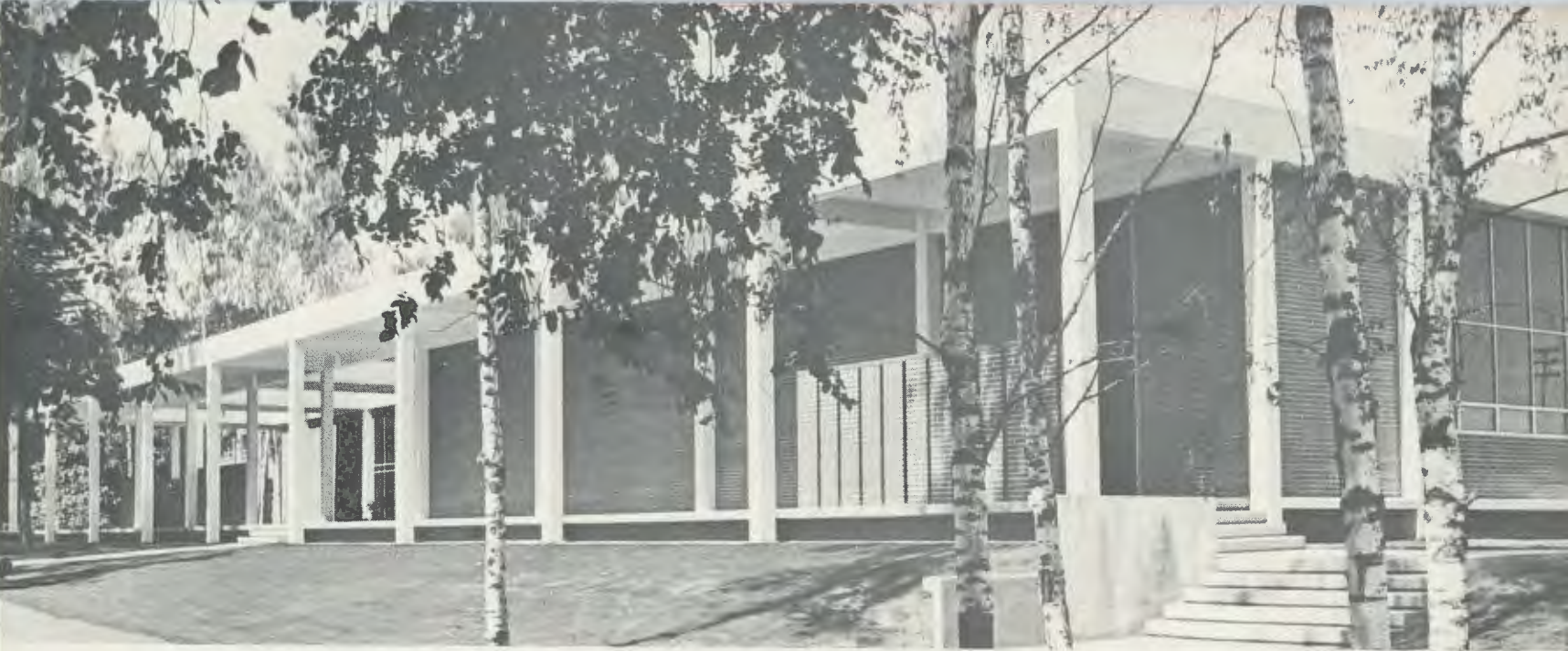
WASHBURNE HALL—UNIVERSITY CENTER