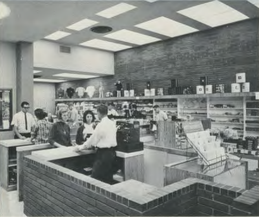
STUDENT CENTER BOOKSTORE