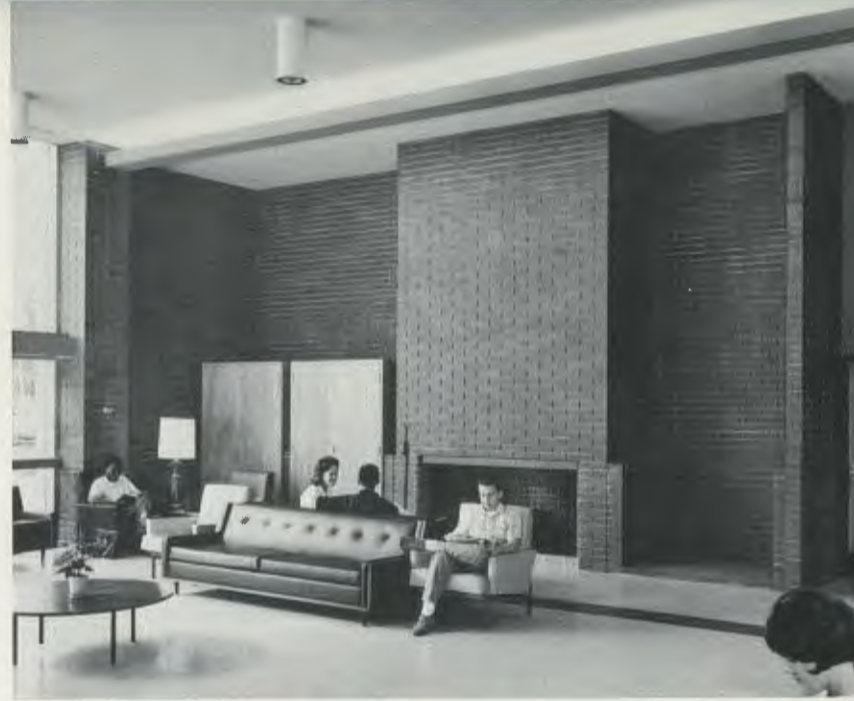
STUDENT CENTER LOUNGE

A student hurriedly gulps a cup of coffee just before a big test, the humanities division holds its regular monthly meeting, a young coed receives treatment for a sore throat, several fellows relax with a game of ping pong during a break from class and a professor chats informally with a small group of students. All these things and many more go on simultaneously each day in the University's new multi-purpose student center, Washburne Hall.