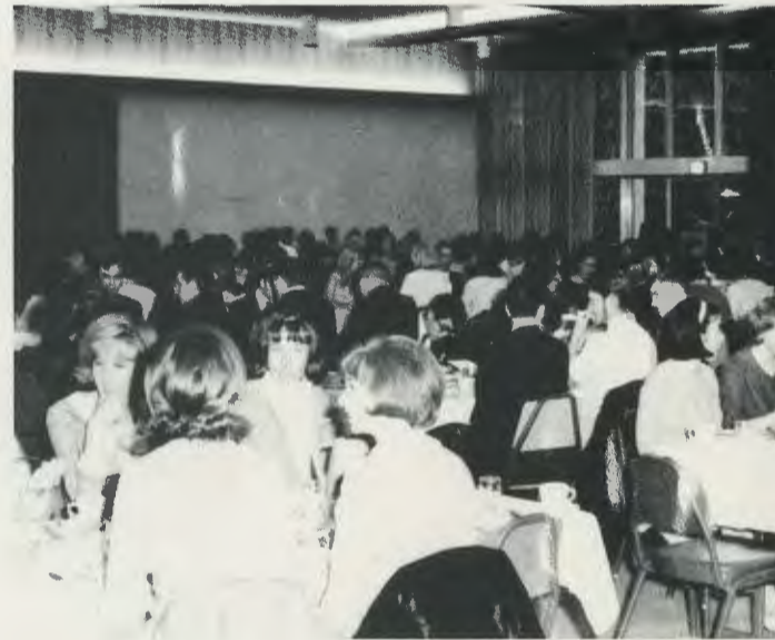
STUDENT CENTER DINING COMMONS

The concept of putting so many things under one roof is not unique. It is sound policy among educational planners who realize that spheres of activity exist on the campus, and that they should be recognized both theoretically and geographically. One of these is the social-cultural life, and it is under this category that Washburne Hall serves so many functions. Its proximity to the dormitories (immediately east of Walter Hall) concentrates the social-cultural aspect of the campus in one area where most of a student's non-academic pursuits can be fulfilled.