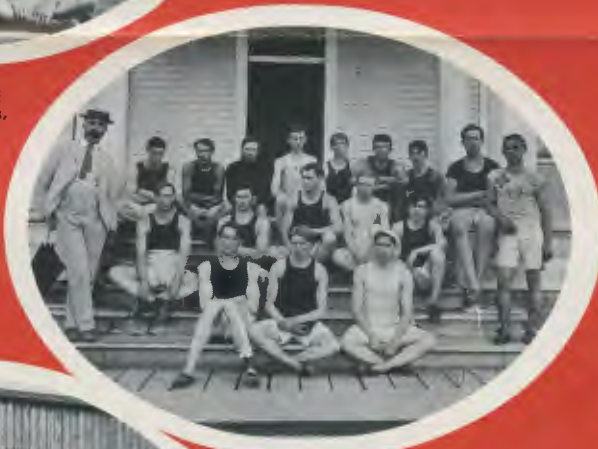
Make it pretty, boys. Track team of 1906.