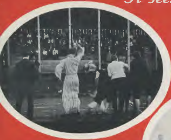
A typical cheerleader's uniform before the turn of the century.