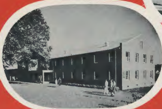
Warner Hall, built in 1947.