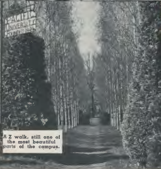
A Z walk, still one of the most beautiful parts of the campus.