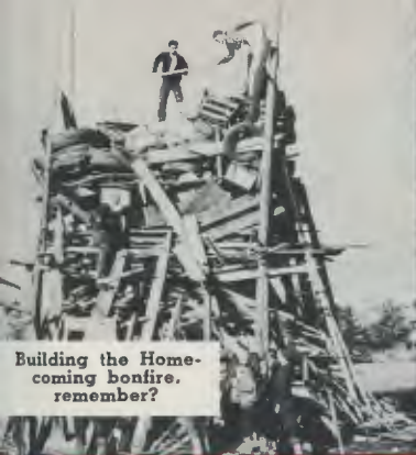
Building the Homecoming bonfire. remember?