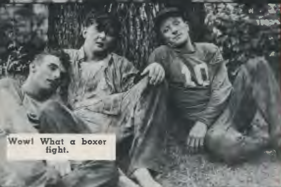
Wow! What a boxer fight.

Whether you were class of '97 or '51... those college years were wonderful!