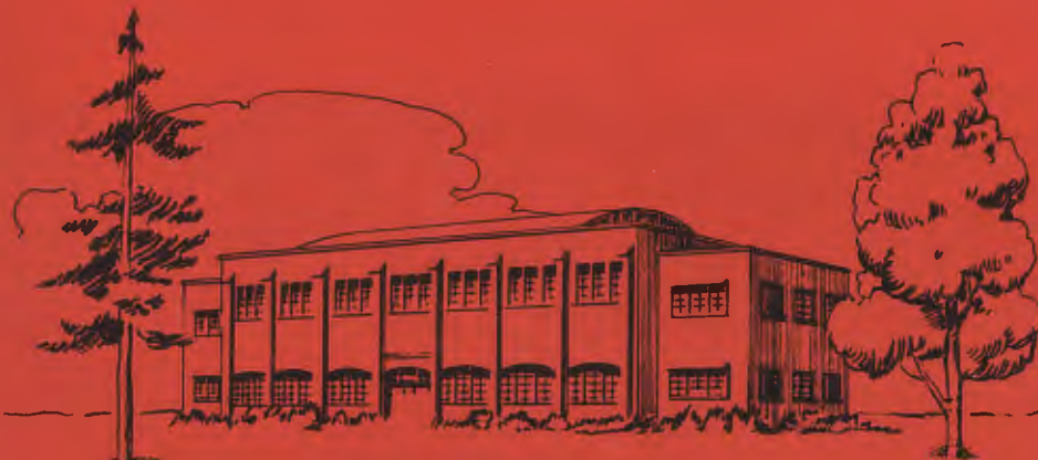
Drawing of proposed gymnasium.

Whatever you feel like giving will be appreciated. You may make your contribution in one lump sum or in as many payments as you desire. For example, a $100 gift can be paid at the rate of $33.33 every four months over the period of a year or once a year over the period of three years, etc. Enclosed you will find a blank check and a pledge card; use whichever one you desire. Of course, you can deduct your contribution from Federal and State income taxes to the extent provided by law.