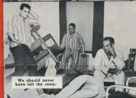
We should never have left the room.