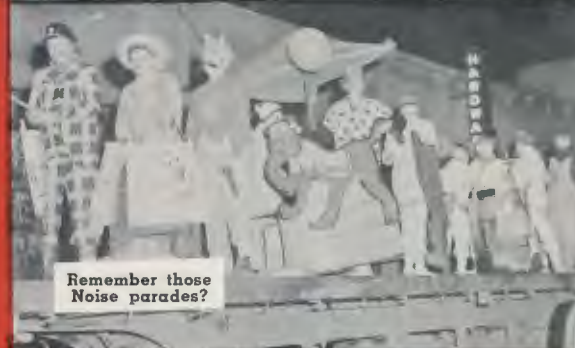
Remember those Noise parades?

You and I . . . all of us . . . are a part of that growth which has made Pacific the wonderful place it is.