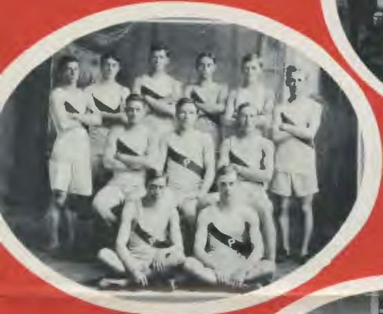
Basketball champions of Non-conference colleges, 1911.