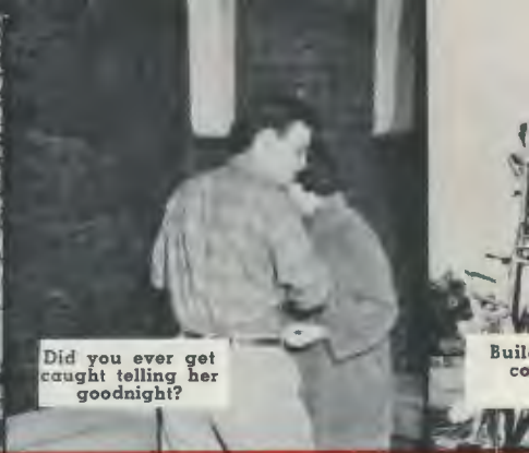
Did you ever get caught telling her goodnight?