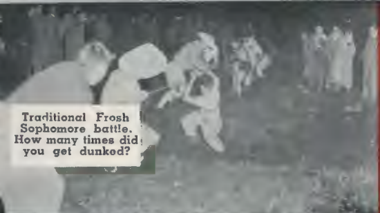
Traditional Frosh Sophomore battle. How many times did you get dunked?