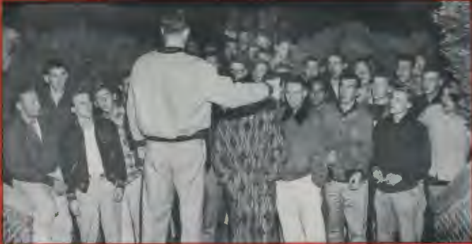
Sing it pretty, boys.