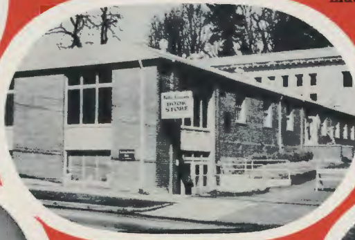
Student Union Bldg. and University Bookstore, completed by students' finances in 1951.