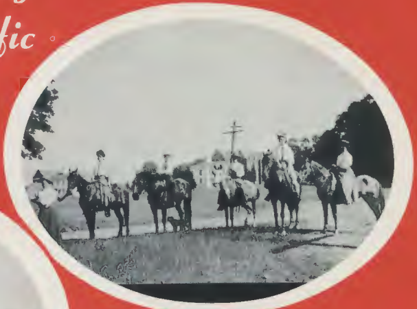
Even the girls believed in physical fitness.