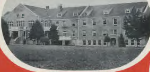
McCormick Hall, men's dormitory, addition built in 1947