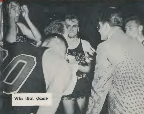
Win that game