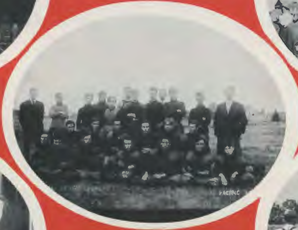
The best looking football team in Pacific's history, the team of 1906.