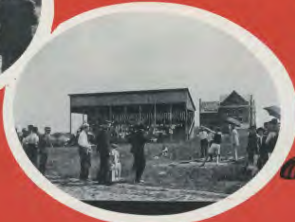
Hey fellows, look! ... a photographer.