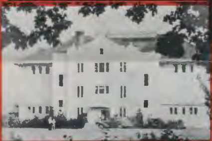
Present gym, built in 1910.