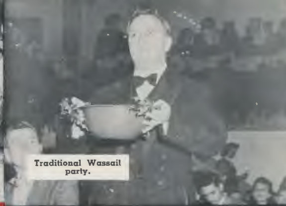
Traditional Wassail party.