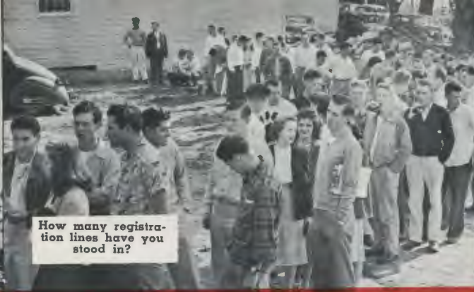
How many registration lines have you stood in?