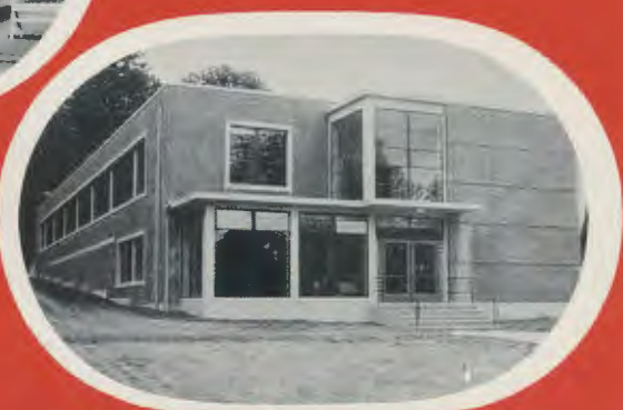
Jefferson Hall, finished 1952, new Optometry Bldg.