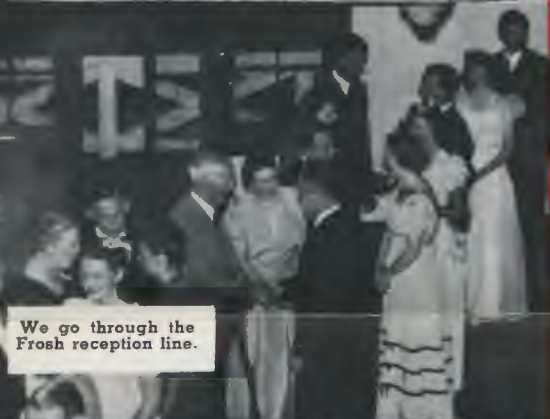
We go through the Frosh reception line.