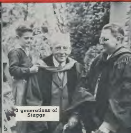
3 generations of Staggs