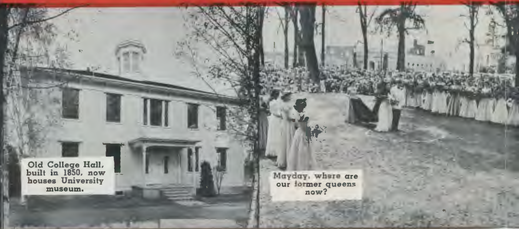
Old College Hall, built in 1850, now houses University museum.