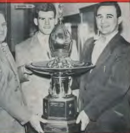
Football winners, 1951.