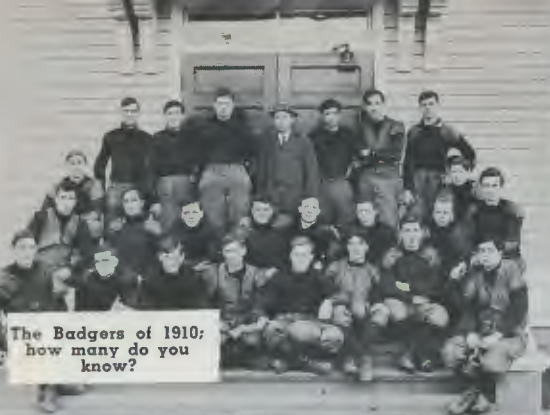
The Badgers of 1910; how many do you know?