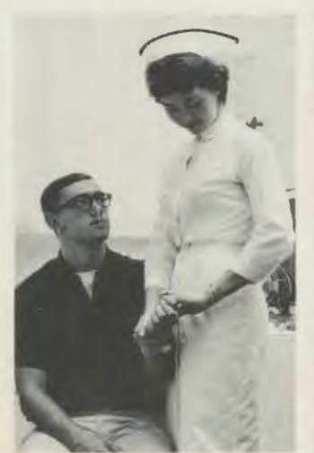
A nurse is always on duty in the campus infirmary.