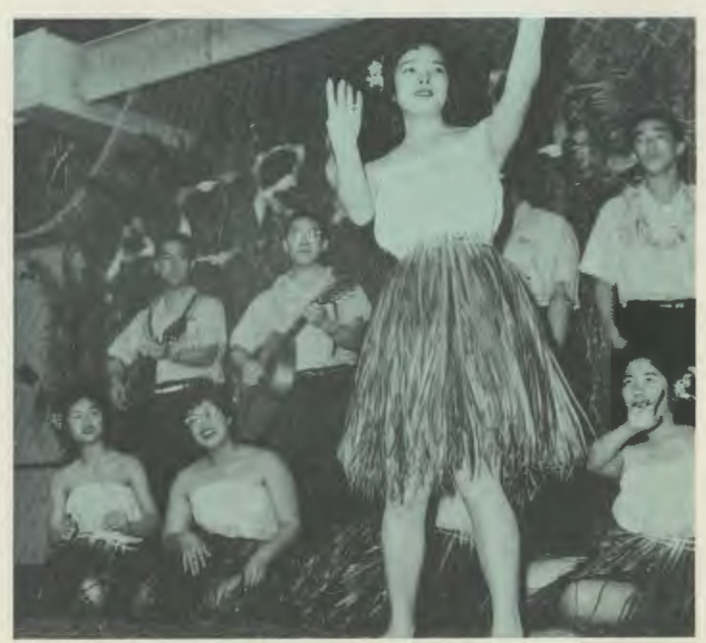
Gaiety prevails at the annual Luau sponsored by Hawaiian students.