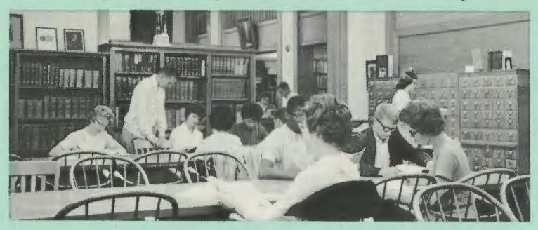
the promise of a continuing balance of self-reliance, independence, freedom and

Library reading rooms offer a quiet retreat in which to read or study.