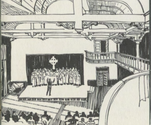
Marsh Hall Auditorium is the scene of many cultural events.

Old College Hall houses the chapel, the Pacific Museum and the victory bell.