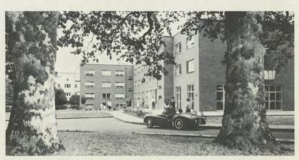
Walter Hall for women is new and gracious, a pleasant place to live.