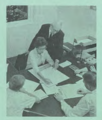
The campus newspaper and yearbook are directed by students with assistance from the Department of Journalism.