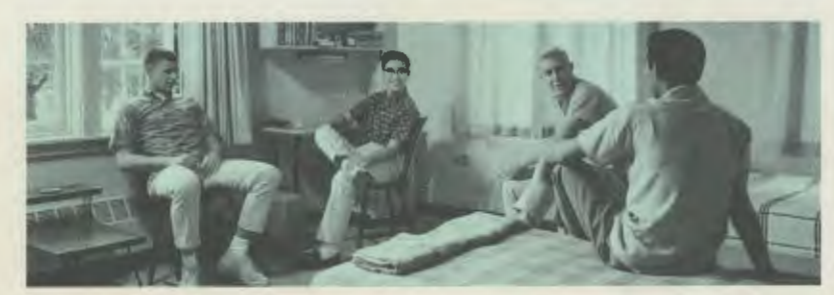
The residence halls make provision for a variety of friendly contacts among students from many lands.